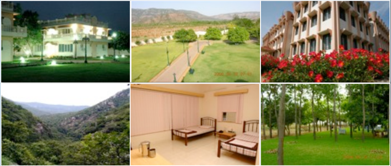
Oneness University, India